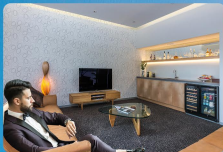
Jet Client Executive Lounge