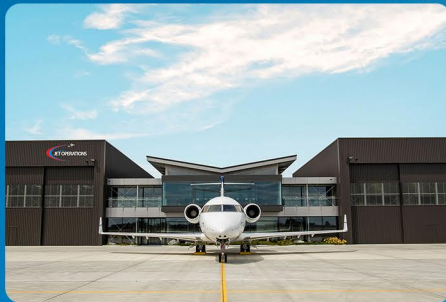
Challenger 604 at GCH Aviation Headquarters