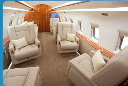
Challenger 604 Cabin Interior