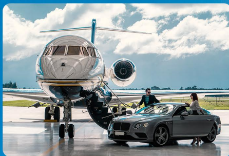
Direct All Weather Boarding and Disembarking